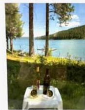
Lunch on Windy Bay, Coast of Alena Lake A Hearty Lunch and a half-hour boat ride will be provided for 6 people. Date to be determined by participants.