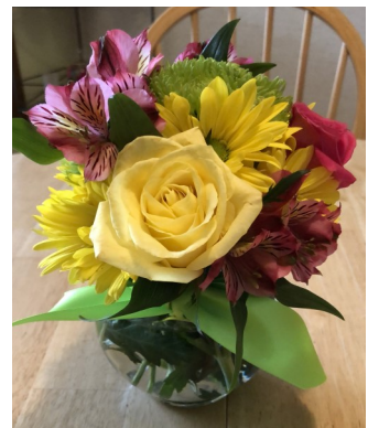
Centerpiece from January luncheon.