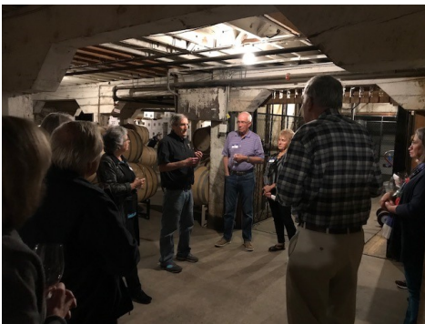
At Barrister Winery in the cellars during November 2 Wine Tasting.