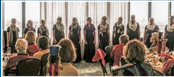
Ferris HS Canterbury Belles