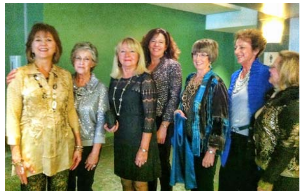
Photos from November Luncheon & Fashion Show